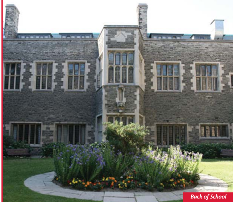
Back of School